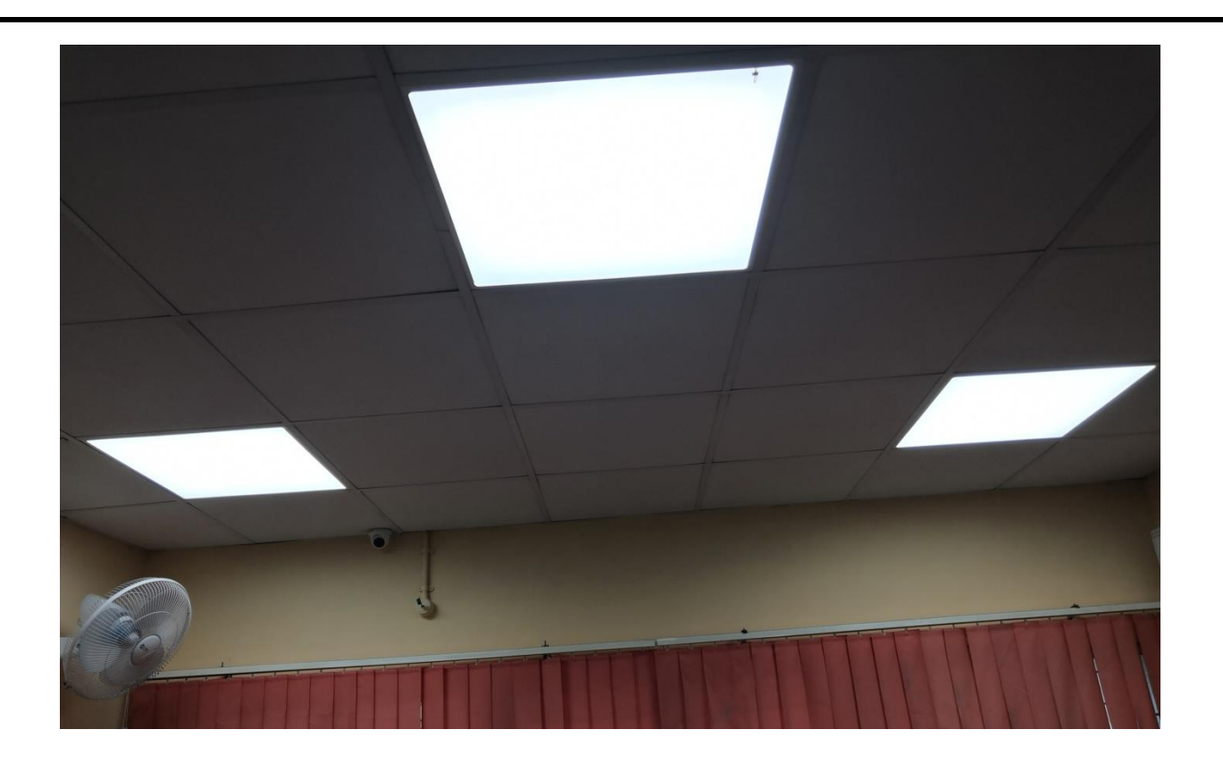
Photograph showing the LED based power efficient bulb