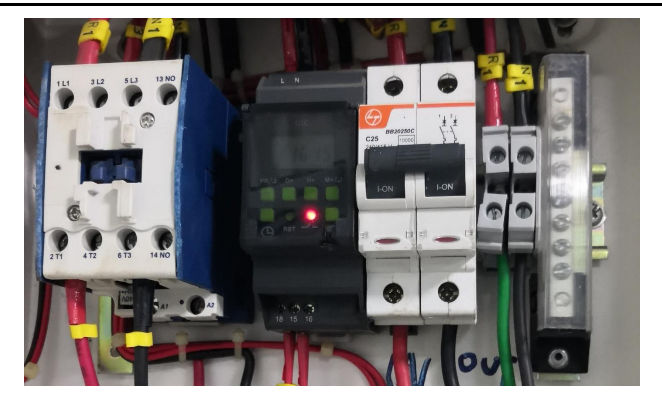
Photograph of sensor based energy conservation system that switches off AC at a defined time.